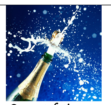
Congratulations to WIPAC's 10th Year Presenting wonderful piano concerts performed by fabulous pianists who are winners of international piano competitions!

Reserve a space in advance for the Celebratory Dinner , grand foyer of La Maison Française, immediately following the Award Ceremony.